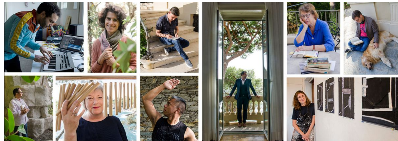
Our first group of Fall 2019 Fellows (above).

"The residency gave me a very comfortable and quiet space to concentrate on my work. At all times I felt supported and I never missed anything."